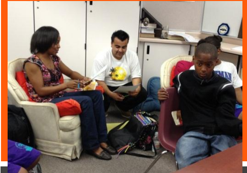
JWMS PARENT WORKSHOP!