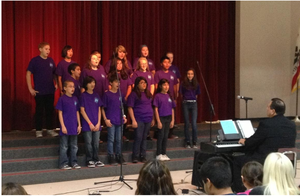
7 TH GRADE CONCERT CHOIR!